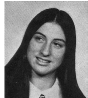
10th grade (1973)