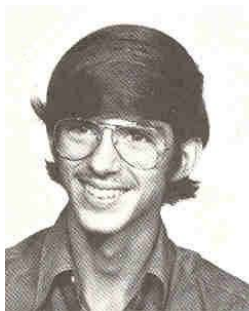
10th grade (1973)