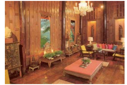
The living room at Jim Thompson's House.

For more details about this trip, contact me by email with a subject line that includes "Back to BKK 2005" or call me at 949-673-4632 (California). Or check out the ISBN website at http://www.isbnetwork.com/backtobangkok/back_to_bangkok_2005.htm