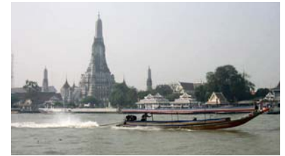
The Chao Phraya River with the Temple of the Dawn in the background.