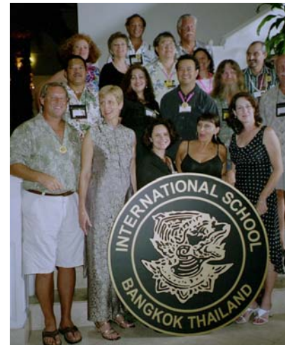
Class of 1974