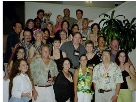
The 556 Club