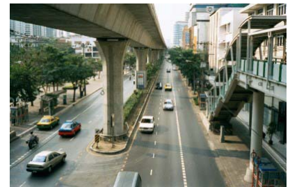
Sukhumvit near soi 35. The Sky Train is now a dominant feature all along Sukhumvit Road.