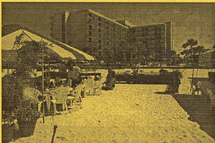
View of the hotel from a beach dining area set for a special banquet