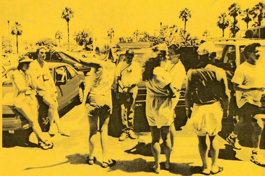
Anyone want to go to go sailing?? The weather was absolutely gorgeous for the entire reunion