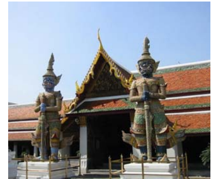
Bangkok in January – what could be better?

Sound interesting? Look for complete details in the next issue of the ISB Network News later this summer or email me at isbmaile@sbcglobal.net .