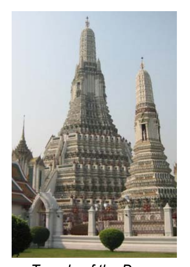
Temple of the Dawn