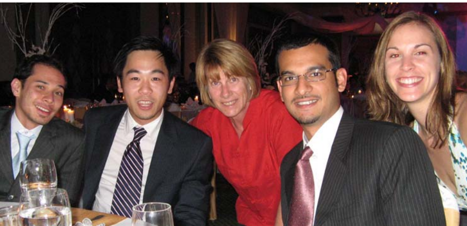
At the wedding reception at the Marriott Resort in Phuket.