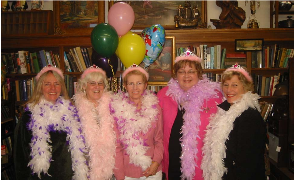
The Soi Sisters celebrate a birthday in Eugene, Oregon, in 2005. One sister was missing because she was in Paris! However, she was there in spirit and sent her good wishes by phone.

When the term “Soi Sisters” is mentioned to non-Bangkok people, they think it has something to do with a group of women who like Chinese food! Actually, the Soi Sisters are a very small group of early 60’s ISB’ers who were inspired by the YaYa Sisterhood and have taken that concept well beyond its original intent. Further motivation came when one of them was diagnosed with Leukemia, and they used their creativity to expand the bounds of nonsense for her entertainment, as well as their own. Buying outrageous gifts for her and themselves helped assuage their sorrow and eventual loss. Now, they embrace silly for their own pleasure and as a means of support for their “sisters” in times of need. If you see any of them in their tiaras at various events, they are evidence of their love for one another and their incredible joy at being ISB’ers.