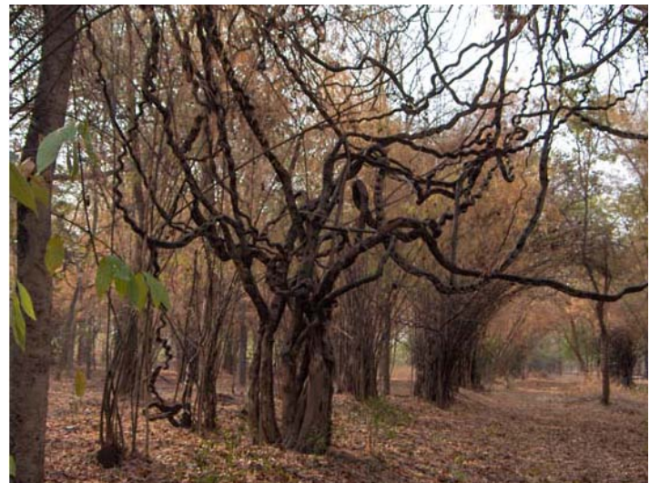
Great tree in the wooded area behind the riding ring