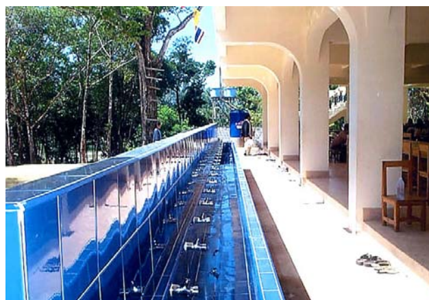
Drinking Water Area

As our commitment is a life long commitment, the fundraising efforts will continue.