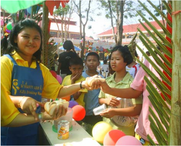
Ice Cream Sandwich Thai Style – a scoop of ice cream on a slice of white bread