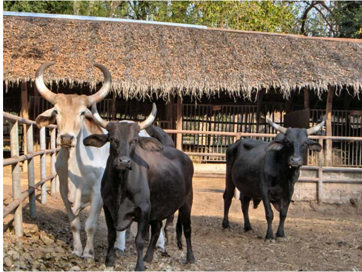
The bulls in the stable yard

The major concerns at the camp these days, besides making ends meet, are keeping the animals healthy and the buildings safe and waterproof. Since I last visited in 2005, former riders and animal lovers around the world have donated over $6000 to help support the animals and the operation. Continuing to offer this type of experience for kids is priceless and I'm thrilled to have been able to help. Much of our donations have gone towards buying medication for the horses, dogs, cats, and even for some cattle and a gibbon that populate the camp. Since medication is constantly required, the need for it never subsides. Now they are supplementing the horses feed with calcium to improve their health. New roofs have appeared and stables repaired, but the constant influx of retired animals in need continue to add to the operating costs.