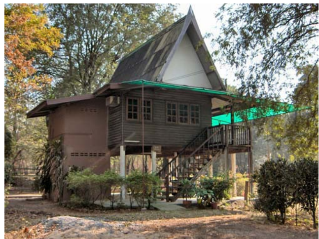
Our lodging for the visit