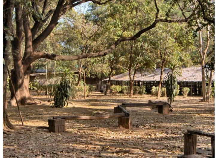
The grounds on the way to the stables