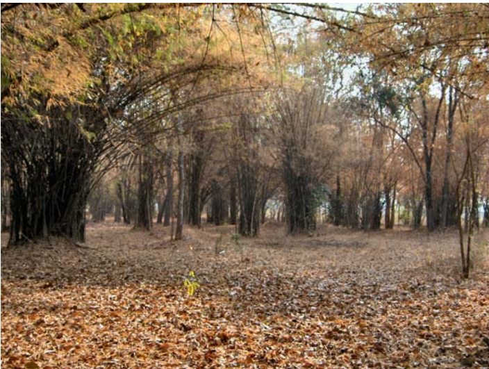
Bamboo forest in the back outside riding area