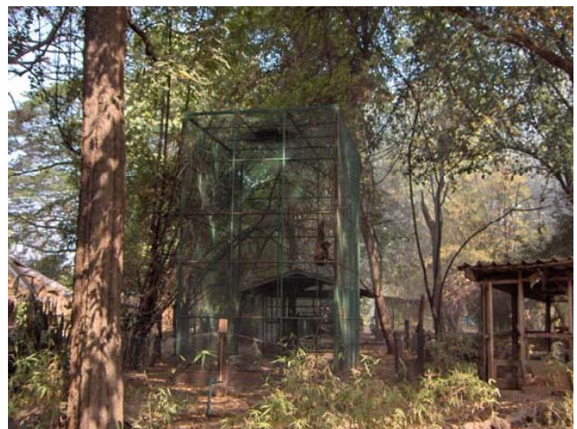
Nini's house between the dining hall and the big tree