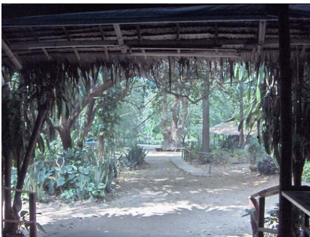
The big tree in the background as seen from the dining area