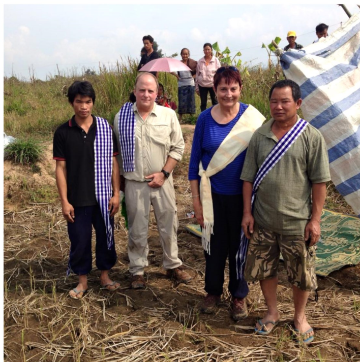
Crash Site Northwestern Laos

This is a picture I took while traveling down the Mekong River from Pak Beng to Luang Prabang. The “hill” on the other side has a small river just in front of it called Pak Ou that empties into the Mekong. In a cave in this hill are Buddhas that throughout the centuries, people placed Buddha statues there.