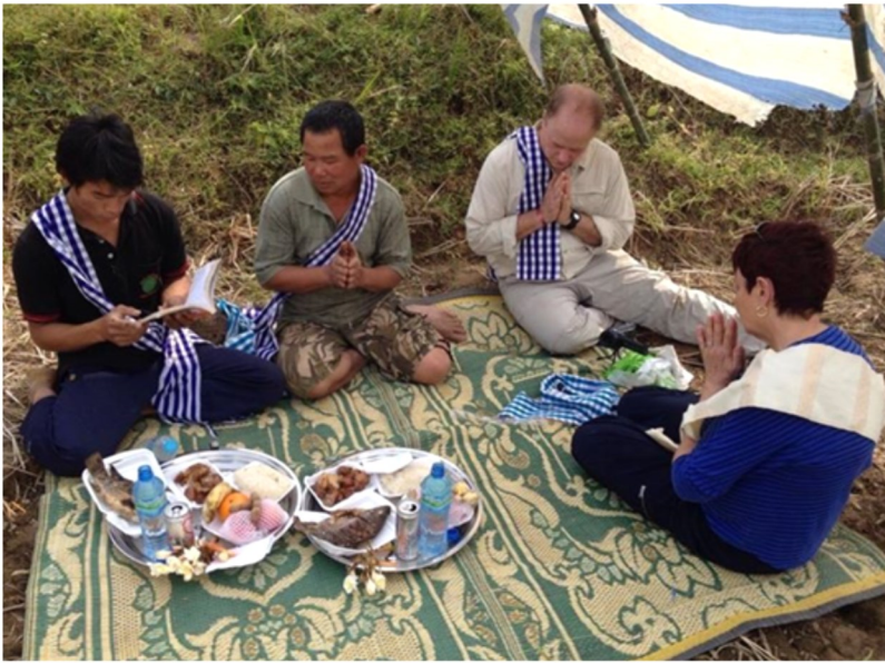
Our Buddhist Ceremony with the help of local villagers

This past January-February (2015) I traveled to Thailand, Laos, and Myanmar for 3 weeks. The first part of my journey was to finally visit my father's crash site in Northwestern Laos (near Pak Beng). For those who do not know, my father was an Air America pilot who was shot down by Chinese troops in Northern Laos. That morning was December 27, 1971. We lived in Vientiane at the time after 5 years in Bangkok. My father and his crew (3) are still missing. The suspected crash site was found in 1997. Nothing remains except small pieces of wreckage. It is now a small rice patty in a broad rolling valley. Back then, dense forest and remote. I met a man, who was a boy at the time who witnessed the plane being hit. To finally be there, to see, to feel, to know, to cry, has been a life changing event. I know my father died that day. We held a Buddhist ceremony with the help of villagers. A wife of one of my father's crew was with me.