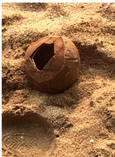
The coconut that we used to contain John's ashes before sending them out to sea.