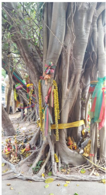
Spirit Tree, Buddha Hill, Pattaya