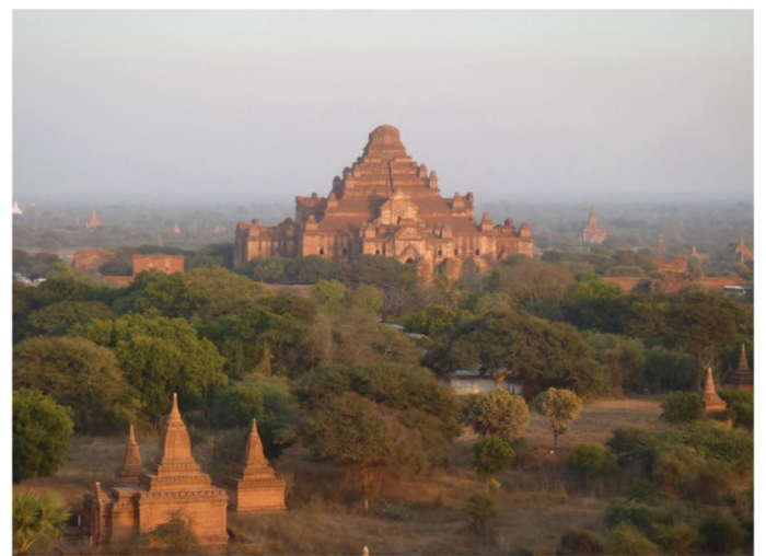
Bagan, Buddhist Pagodas

The second week I spent with classmates from the American School of Vientiane. A wonderful time with some I had not seen in 40 years. My time in Laos was brief. But those memories are the richest and the most bittersweet of my Asia life. Laos is wonderful. In my heart, it is home. The final week, I travelled alone to Myanmar. A place I have dreamed of. I visited Mandalay, Bagan and Yangon (Rangoon). Bagan was my prized destination. Its ancient Buddhist pagodas, that rise up around you and as far as you can see, are peaceful and beautiful beyond words. To watch a sunset from atop of one of them, through the smoky haze of evening fires, gave me time to deeply reflect on all that I had seen and have ever been.