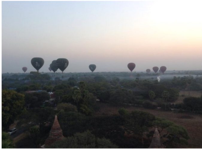
Balloon ride over the Pagodas.