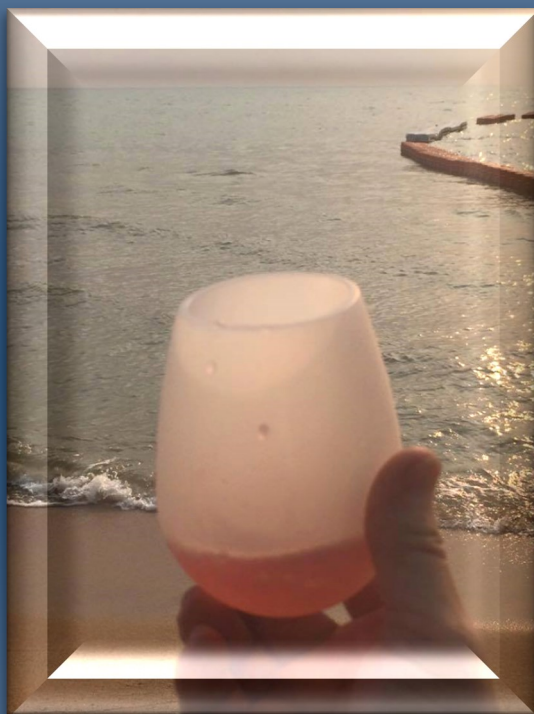
A glass of wine that we toasted with when spreading John's ashes