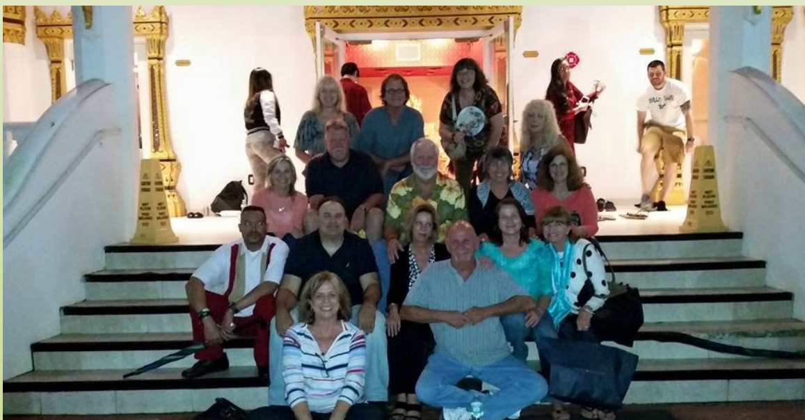
ISB Alumni, Wat Mongkolratanaram Buddhist Temple

were lit and hundreds of krathongs were released one-by-one with a wish – sending bad luck away. We were all moved by the lights, beauty and symbolism - sharing that moment with other ISB friends forever imprinted it into our memories. As with any reunion, it was hard to say goodbye and go our separate ways the next day, but I know we'll return and every one of us can't wait for the ISB Network reunion in Daytona!