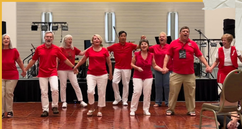
Young Internationals and Mimi's original YI outfit

The Teen Club musicians and singers kept the dance floor full for several hours before our group meandered back to the various party suites in the South Tower. Each of our party suites opened onto a large balcony with a clear view of the Daytona Beach nighttime skyline and the added bonus of witnessing two rocket launches. Several of our alumni even saw the sun rise from the party suites balcony.