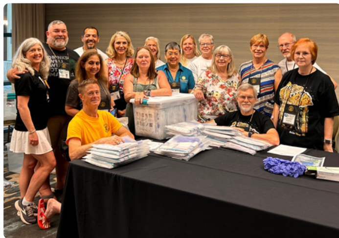
2023 Daytona Beach